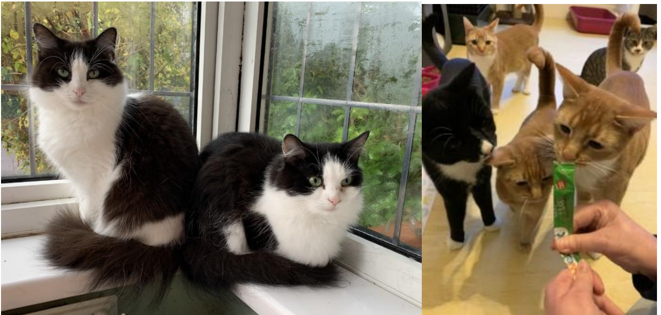
Alice Cooper and Peller in the office. The Twilight Zone cats enjoying Christmas Lick-e-Lix.