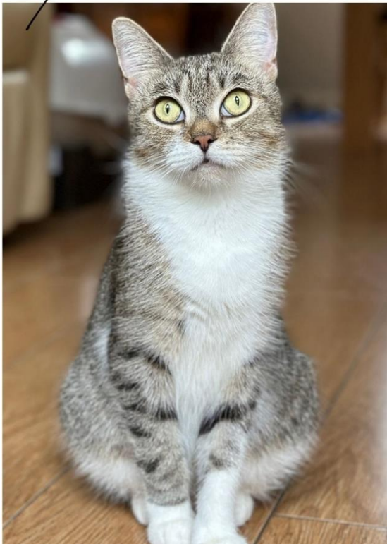
7 YEAR OLD FEMALE